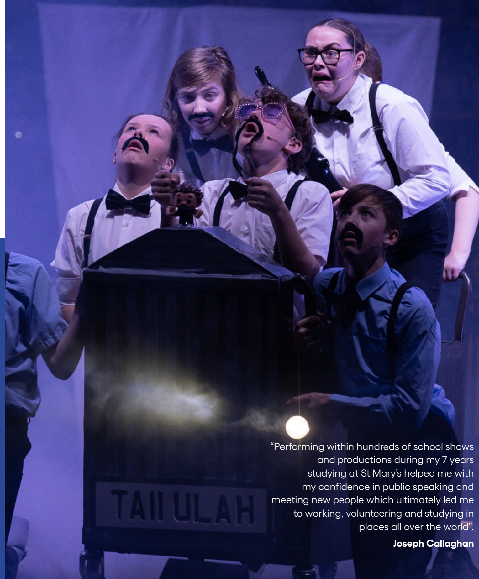
Bugsy Malone on stage at the Floral Pavilion, New Brighton

"Performing within hundreds of school shows and productions during my 7 years studying at St Mary's helped me with my confidence in public speaking and meeting new people which ultimately led me to working, volunteering and studying in places all over the world".