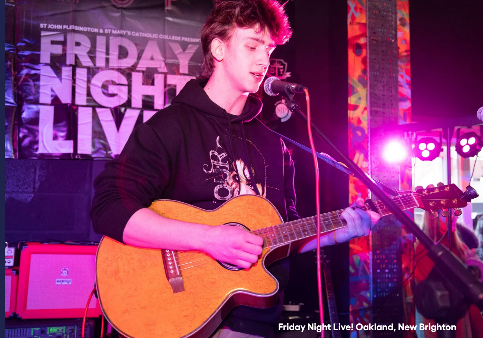
Friday Night Live! Oakland, New Brighton

Through our curricular and extra curricular provision we want students to have the best experience possible and create friendships that will last a lifetime.