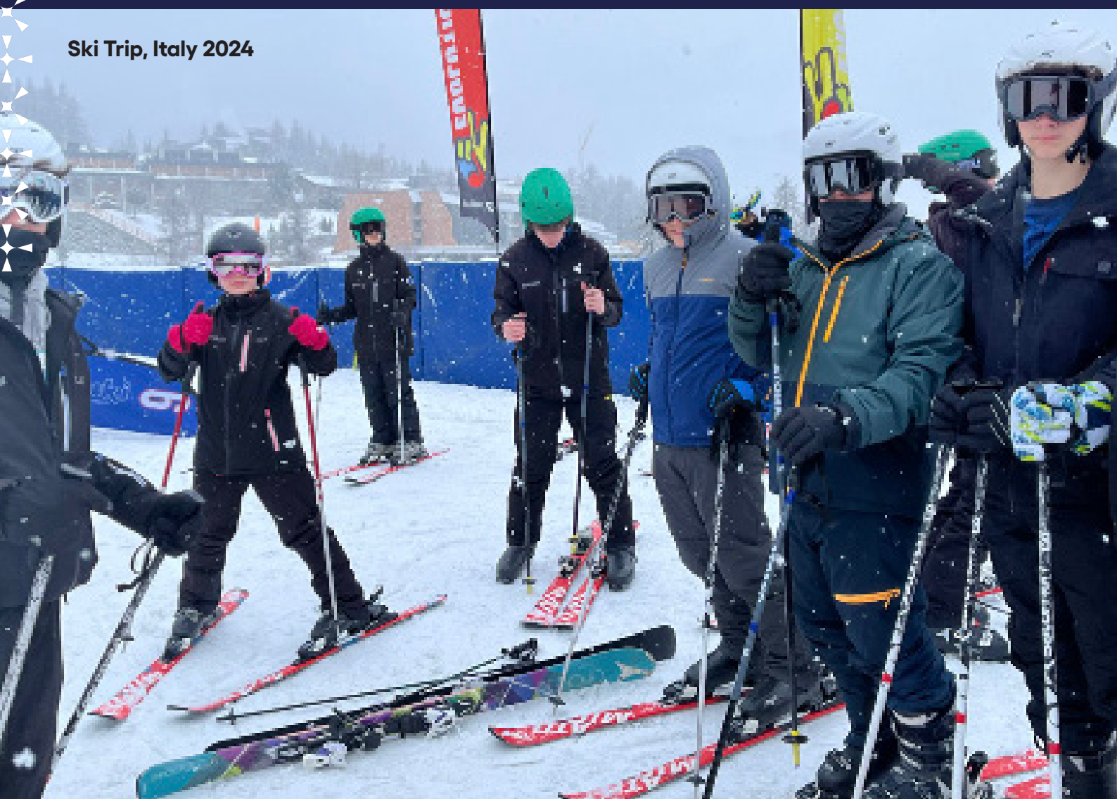
Ski Trip, Italy 2024

Through our curricular and extra curricular provision we want students to have the best experience possible and create friendships that will last a lifetime.